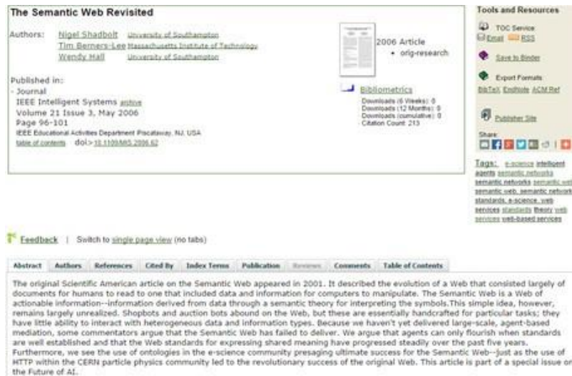
Figure 2. Article "The Semantic Web Revisited" on ACM website.

As can be appreciated, with the same resource there are important changes in the manner in which the information is presented, even in those metadata in which are taken into account, so it becomes necessary unify the basic information of a scientific article in order to design a model supported in some of the aforementioned technologies.