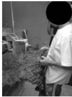
Activities 2 and 3: Mixing-extraction of the mixture