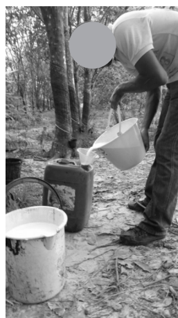
Activity 2: Latex collection in drums